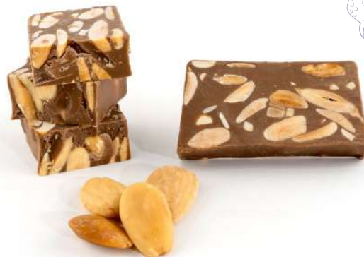
MILK CHOCOLATE AND ALMONDS