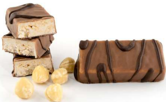
MILK CHOCOLATE AND HAZELNUT CREAM