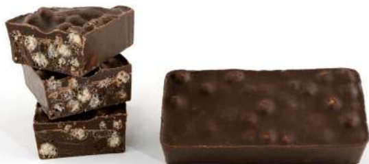
CRISPY DARK CHOCOLATE