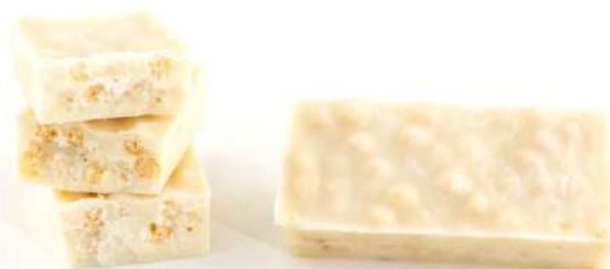
CRISPY WHITE CHOCOLATE