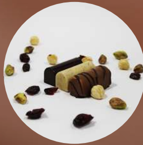
XCOBITE SMALL CHOCOLATE BARS